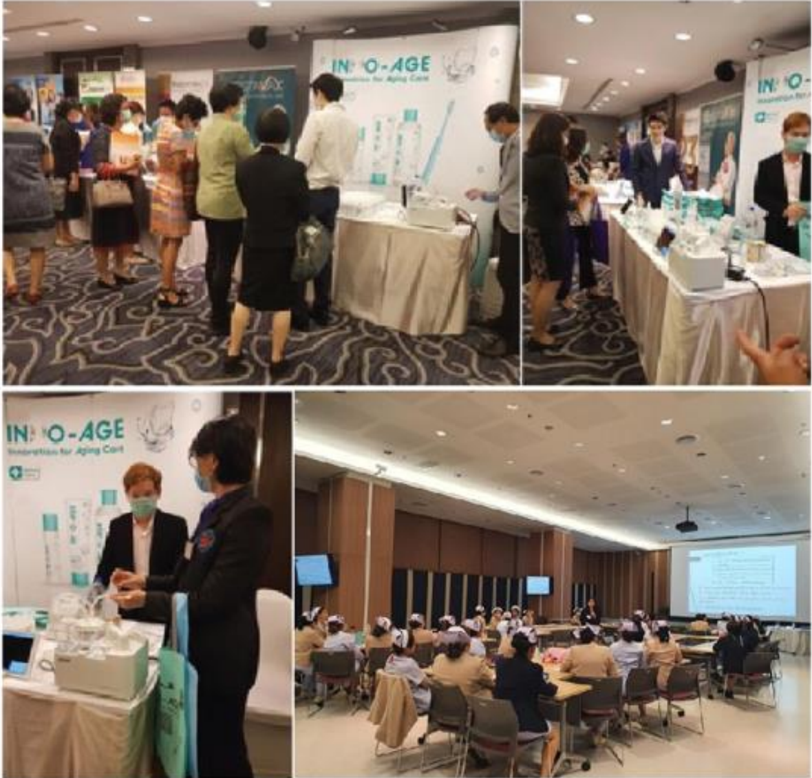
Annual conference the Thai Society of Gerontology & Geriatric Medicine, 2020, Bangkok, Thailand