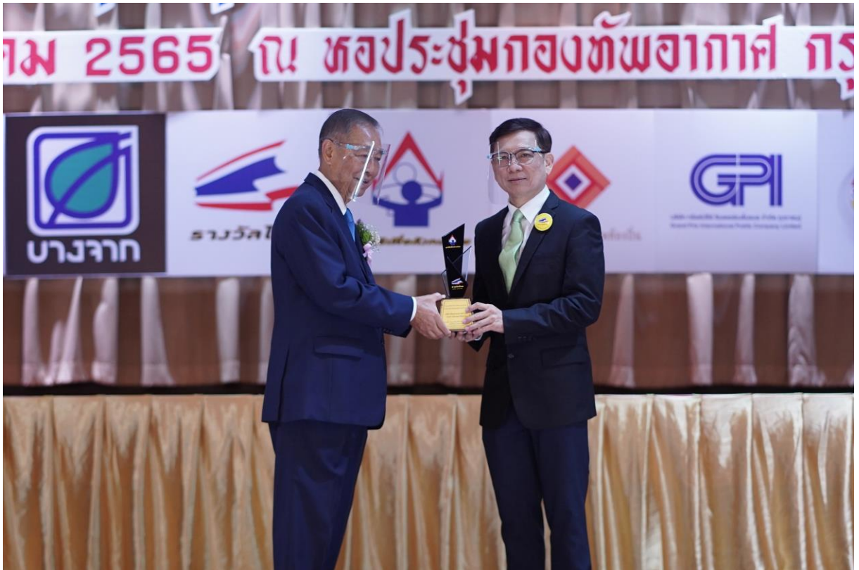
Excellent Innovation Award 2022 For Innovation in Oral Health, 26 August 2022