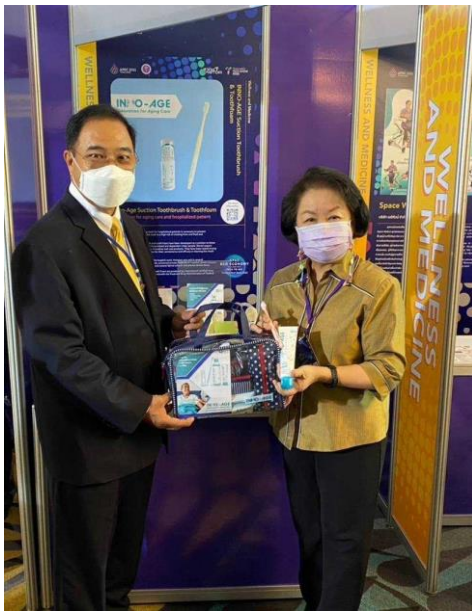
APEC BCG Economy, 2022, Bangkok, Thailand