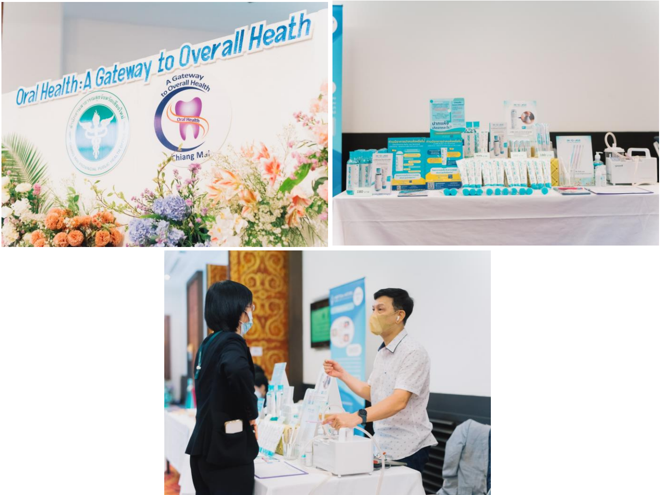
Oral health: A Gateway to Overall Health , 2022, Chiang Mai, Thailand