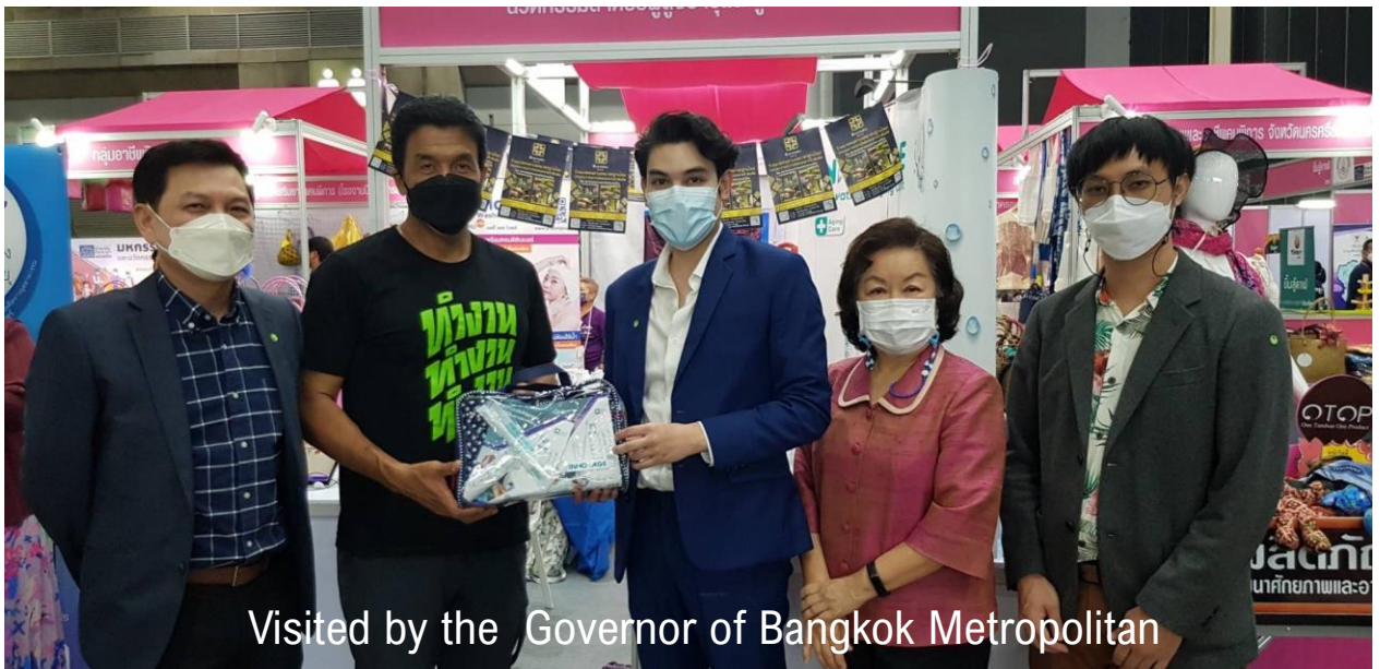
Visited by the Governor of Bangkok Metropolitan

Thailand Friendly Design Expo 2022, BITEC, Bangkok, Thailand