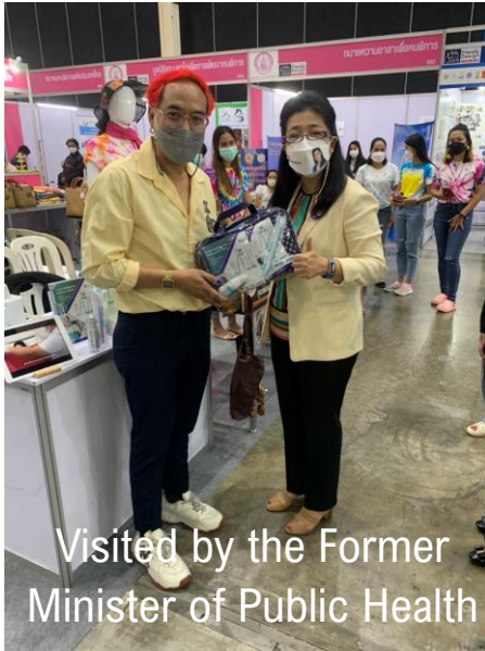
Visited by the Former Minister of Public Health