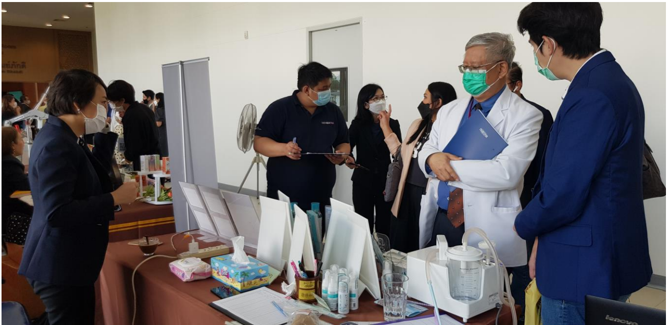
Northern Wellness Economic Corridor, 2022, Chiang Rai, Thailand