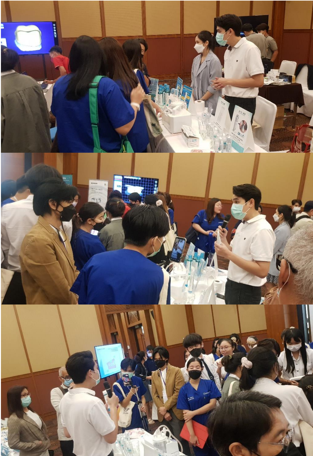
Dental conference, 2022, The Kantary Hill Hotel, Chiang Mai, Thailand